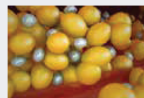
30 Days Metabolism process

The fat cells in the target area begin responding to cryo-crystallization.