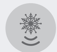
Stable Cryo energy