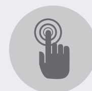
User convenient interface