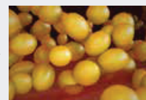
90 Days Eliminated cells

Over the following weeks and months, fat cells are disrupted and eliminated gradually by metabolism.