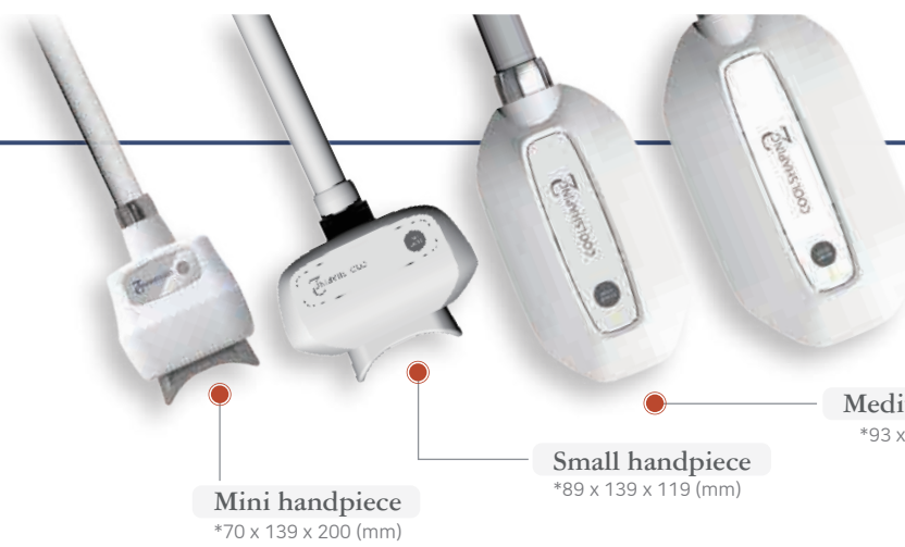
Mini handpiece *70 x 139 x 200 (mm)